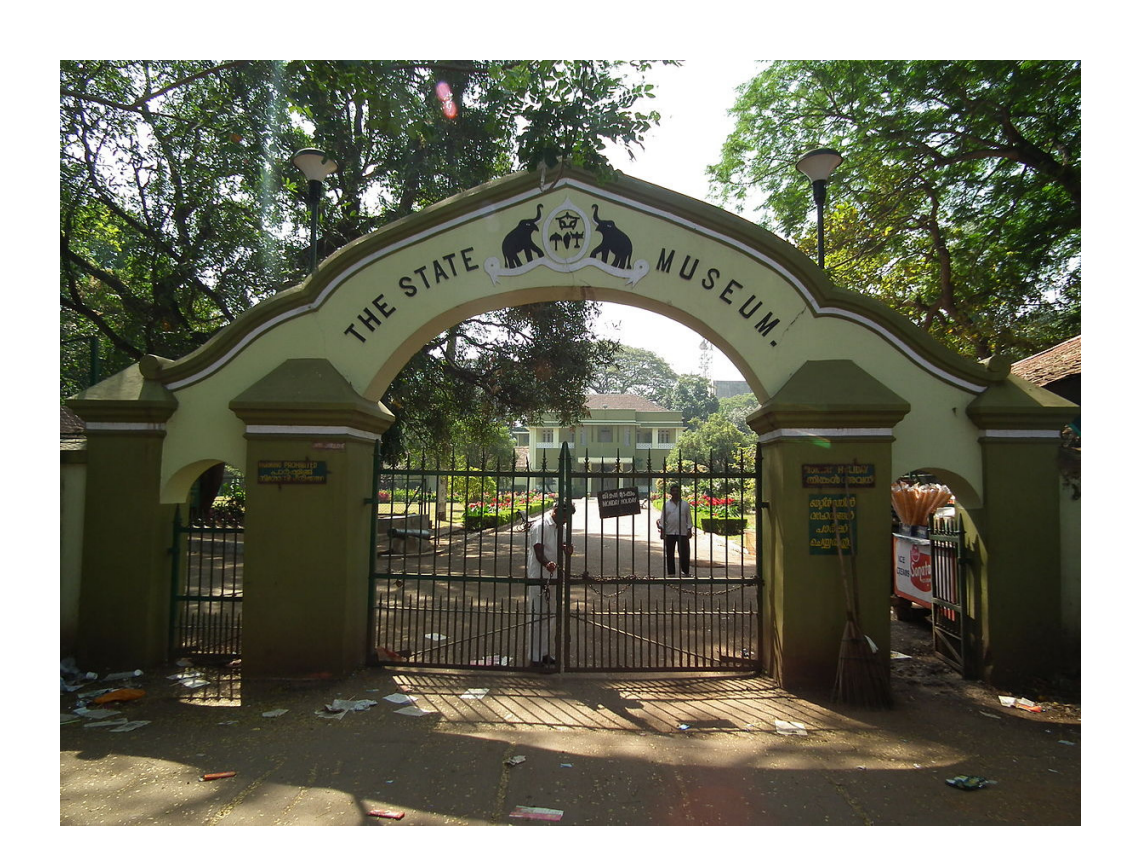
ANNUAL REPORT 2017-18